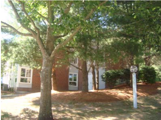
Side of 22B