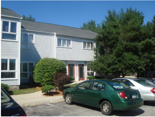
21B & 22B Main Entrances