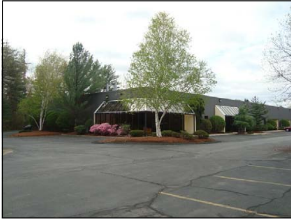
Unit E — End corner