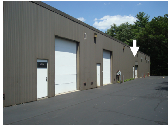
Unit E drive-in 1 of 2