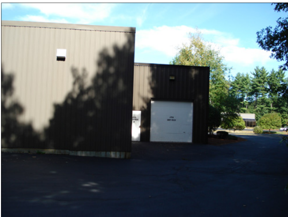
Unit E rear drive-in 2 of 2