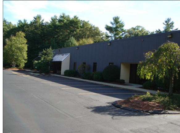
Front Building View