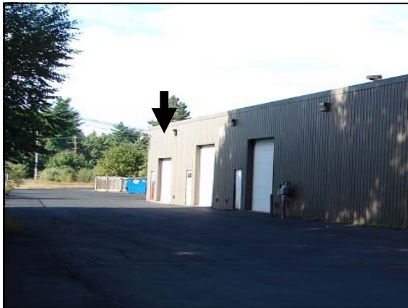
Unit B drive-in 1 of 2 (2 of 2 not shown)