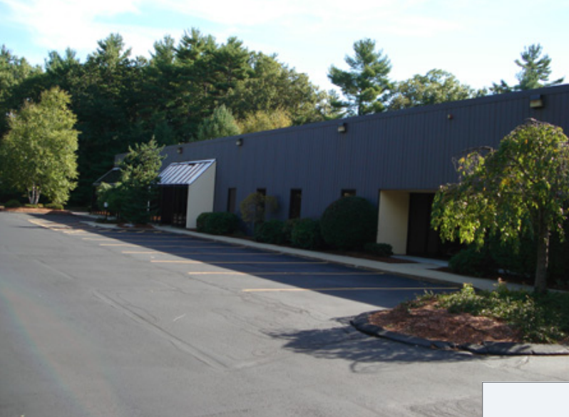
17 Clinton Drive

17 Clinton Drive offers a multi-tenanted flex/office facility located only 4 miles from the Everett Turnpike (Exit 5W), off NH State Route 111 and less than two miles from the MA border.