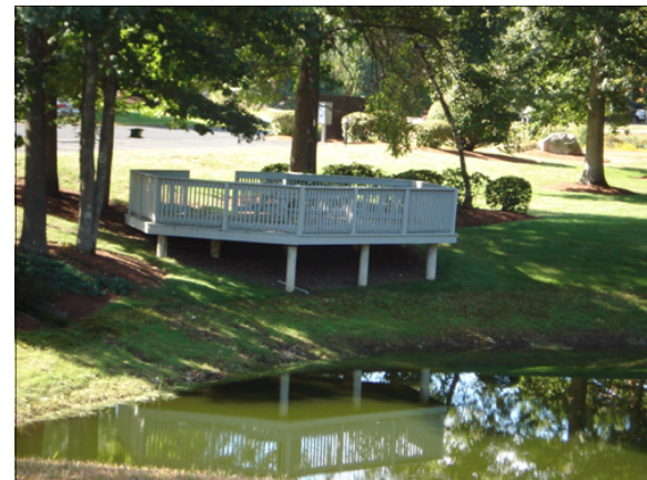
Deck with picnic table overlooking on-site pond