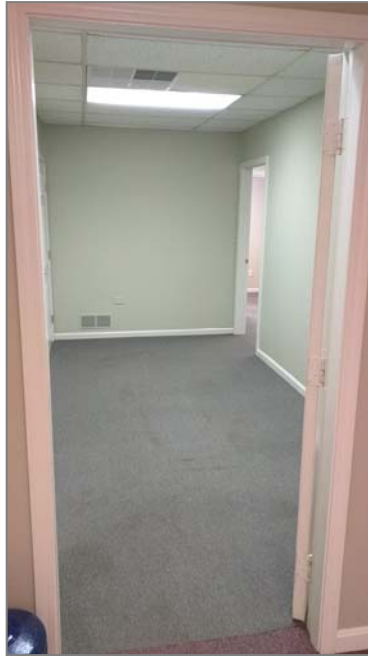
Suite 1512 | Reception/Waiting Rm