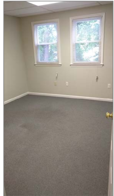
Suite 1512 | Office 1