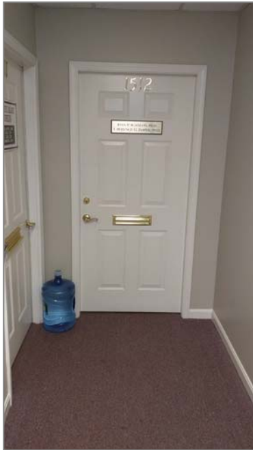
Suite 1512 | Suite Entrance