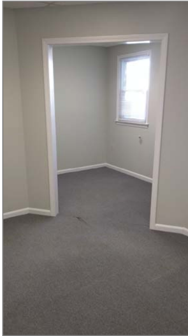
Suite 1512 | Storage Rm / Small Office