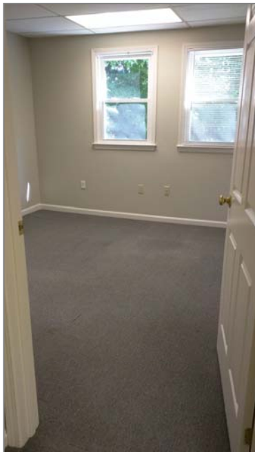
Suite 1512 | Office 2